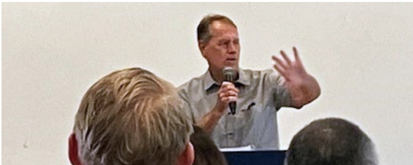
U.S. Rep. Ed Case spoke with attendees at his Veterans Talk Story Session on Saturday, Nov. 23.