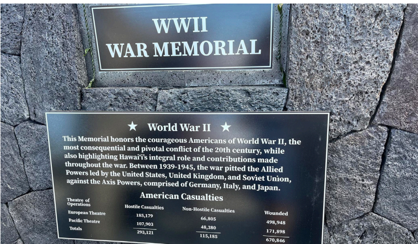
A new monument was installed at the West Hawai'i Veterans Cemetery for the Americans of World War II.